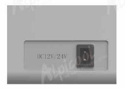
AC/DC dual use