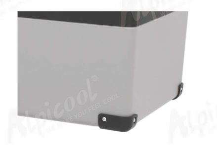
Protective foot pad