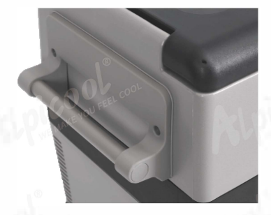
Heavy duty handle