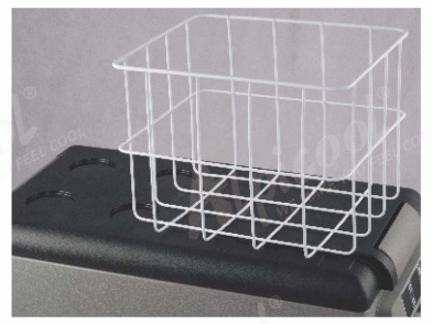
Wire storage basket