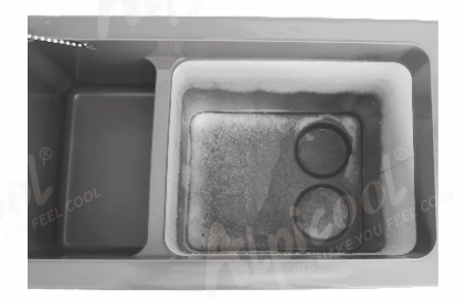
Fridge/freezer dual zone

Alpicool Inc. www.alpicool.com marketing@alpicool.com TEL:909 930 5002 ADD:799 E Cedar St, Ontario, CA 91761